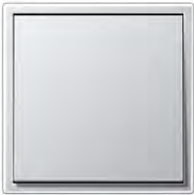
LS 990 By Jung HQ